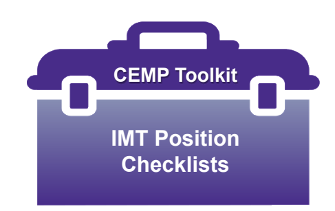
Table 5 outlines suggested facility positions to fill each of the Incident Management Team positions. The most appropriate individual given the event/incident may fill different roles as needed.

Incident Management Team activation is designed to be flexible and scalable depending on the type, scope, and complexity of the incident. As a result, the Incident Commander will decide to activate the entire team or select positions based on the extent of the emergency.